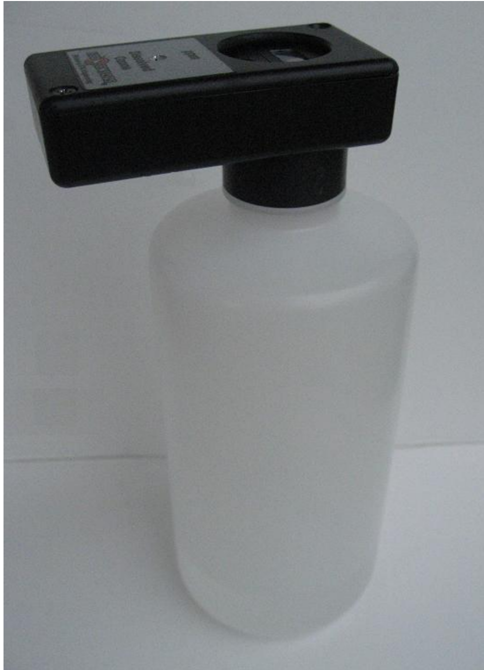
Figure 3: DO3 on sample bottle for measurement.