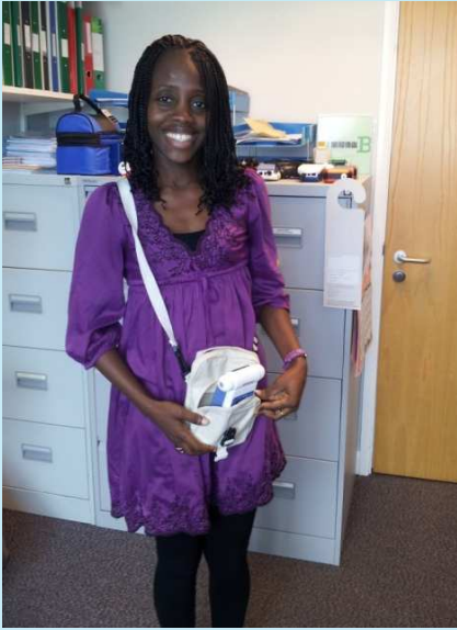
A student models the Aeroqual Series 500 ENV

Other handheld monitors are suitable for health and safety applications but lack sufficient accuracy for credible ambient air quality measurements. Conversely, chemiluminescence analysers are very accurate but too large and cumbersome to be carried around by her volunteers.