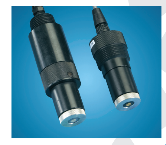
Submersion and Flowcell Sensors

Submersible combined chlorine sensors can sometimes be used for measuring total chlorine in wastewater effluent. Wastewater effluents containing more than 1 PPM of ammonia, often result in a chlorine residual that is more than 90% monochloramine. Direct measurement with a submersible sensor can provide a dependable monitor without all the sampling and chemicals associated with total chlorine measurement.