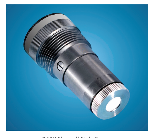
Q46H Flowcell Style Sensor

ATI'S Model Q46H Chlorine Monitor is the latest version of our proven Q Series monitoring instruments for free or combined chlorine. Monitor capabilities have been expanded to include options for a 3rd analog output or for adding additional low power relay outputs. Digital communication options for Profibus DP, Modbus RTU, Modbus TCP/IP or Ethernet IP have been added, as well.