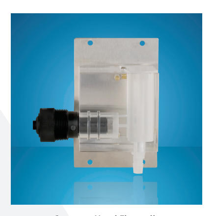
Constant Head Flowcell