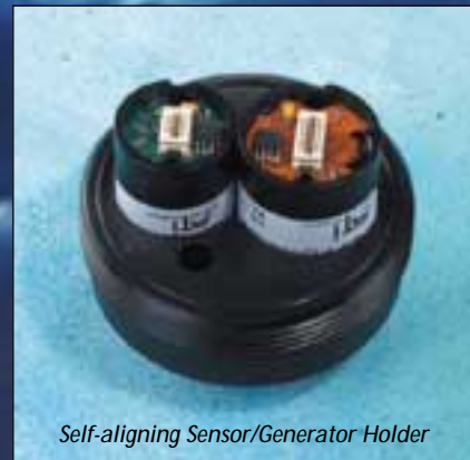
Self-aligning Sensor/Generator Holder