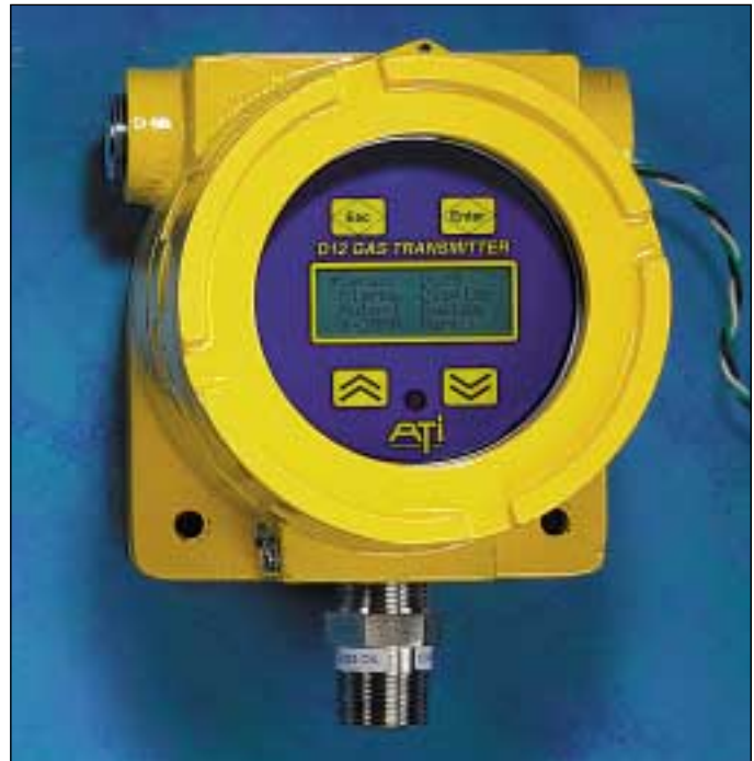
D12 with Combustible Gas Sensor

When RS-485 communication is desirable, D12 transmitters with alarm relays can be supplied with a Modbus(tm) interface. Software supports up to 247 unique addresses for large system use.