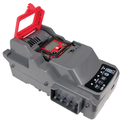
Calibration Station SDM-3R